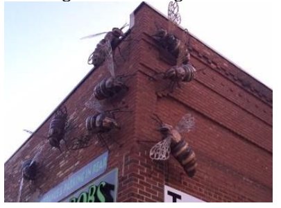
Also, Bees on Broadway!

Down town De Pere, Main street buildings host Bee Art to help bring awareness to honeybees. The ally way is loaded with large bees on the building and there are paintings focusing on bees along the walls.